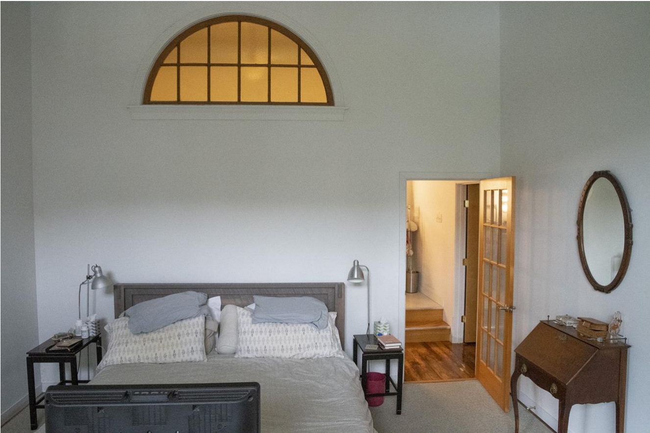
F. Master bedroom- north